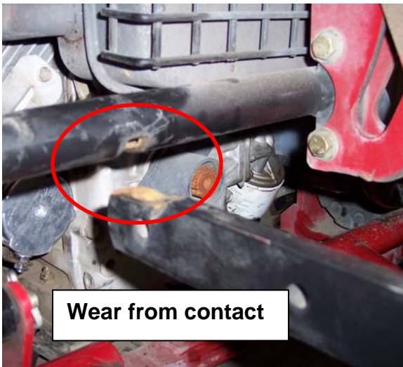
Wear from contact

Machines equipped with either the rear Tooth Rake (08751), Rear Broom (08753) or Drag Mat Carrier (08756) should be fitted with a Lift Arm Protection Kit (115-5607). The Kit contains a high density plastic wear pad (for the Lift Arm) and a Frame Bar Sleeve (for the tractor if needed) that will prevent further damage to the Frame Bar.