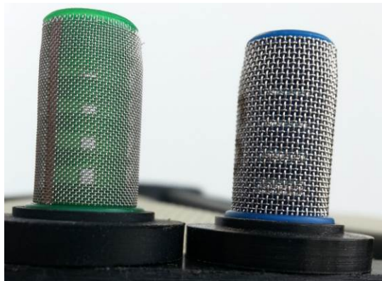
Filter Mesh Size: 50, 100