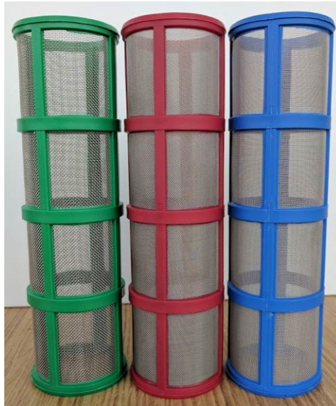
Filter Mesh Size: 30, 50, 100