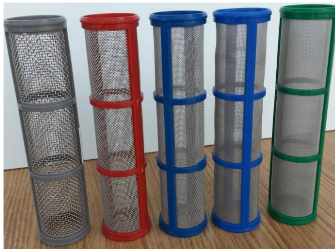
Filter Mesh Size: 16, 30, 50, 80, 100