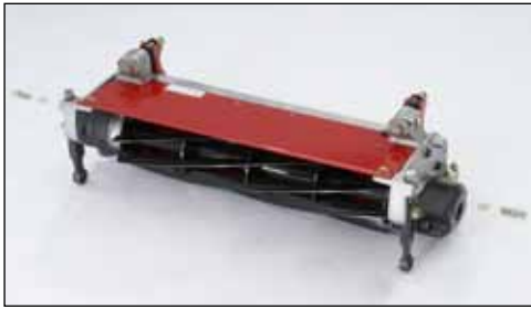
8-Blade Cutting Unit | 04610