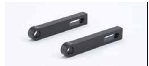
High Height of Cut Kit | 106-4699