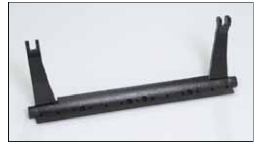
Aggressive Bedbar | 99-3794-03