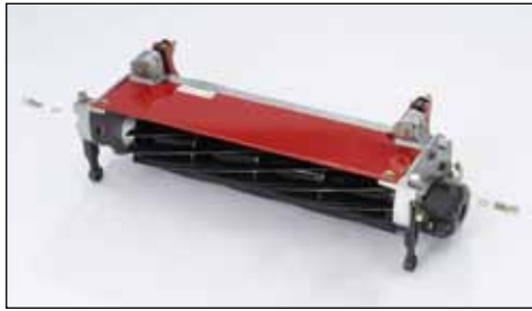
11-Blade Cutting Unit | 04611