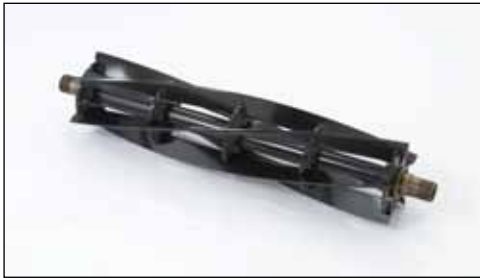
5-Blade Heavy-Duty Reel | 106-2626