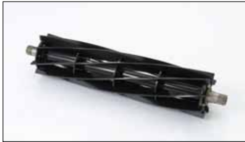
8-Blade Heavy-Duty Reel | 107-9522